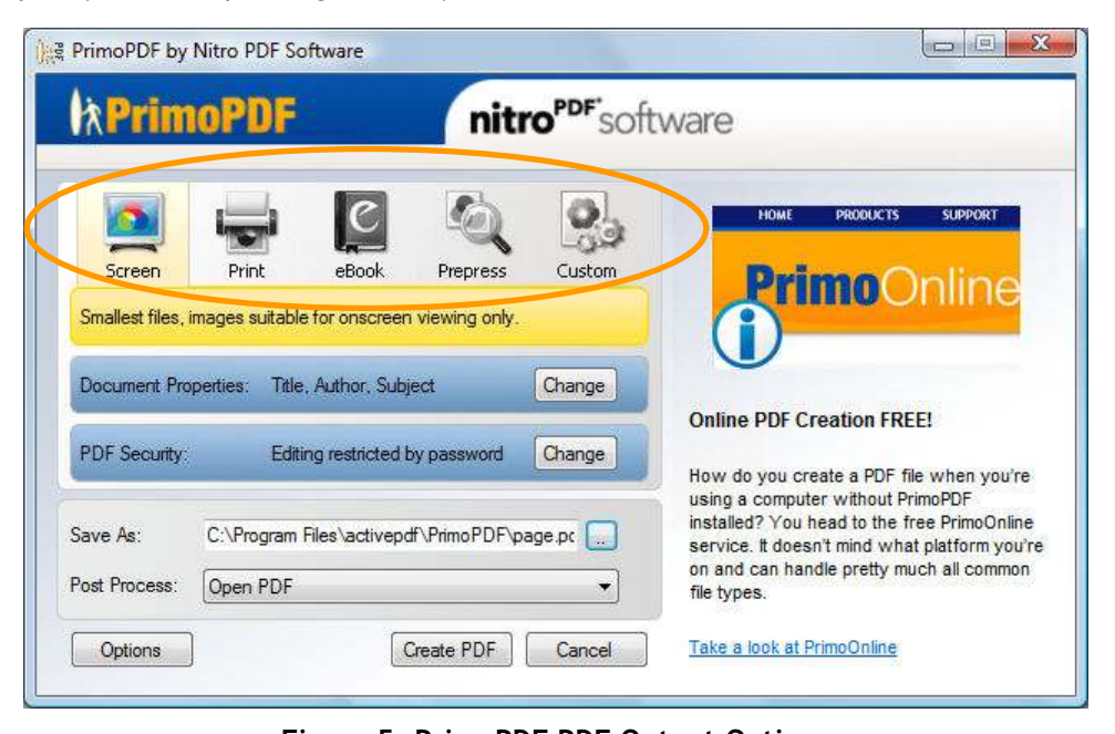
Figure 5. PrimoPDF PDF Output Options

PrimoPDF includes five PDF output options, each of which can be used to produce PDF files at an optimized file size and quality level, depending on how you intend to use the document.