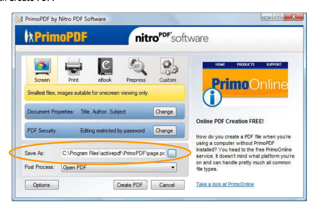
Figure 3. 'PrimoPDF' window

5. If the selected location already contains a PDF with the same name, the File Exists window appears. Depending on your settings, you will be presented with the option to either overwrite or append the PDF to the existing file. Choose from the available options.